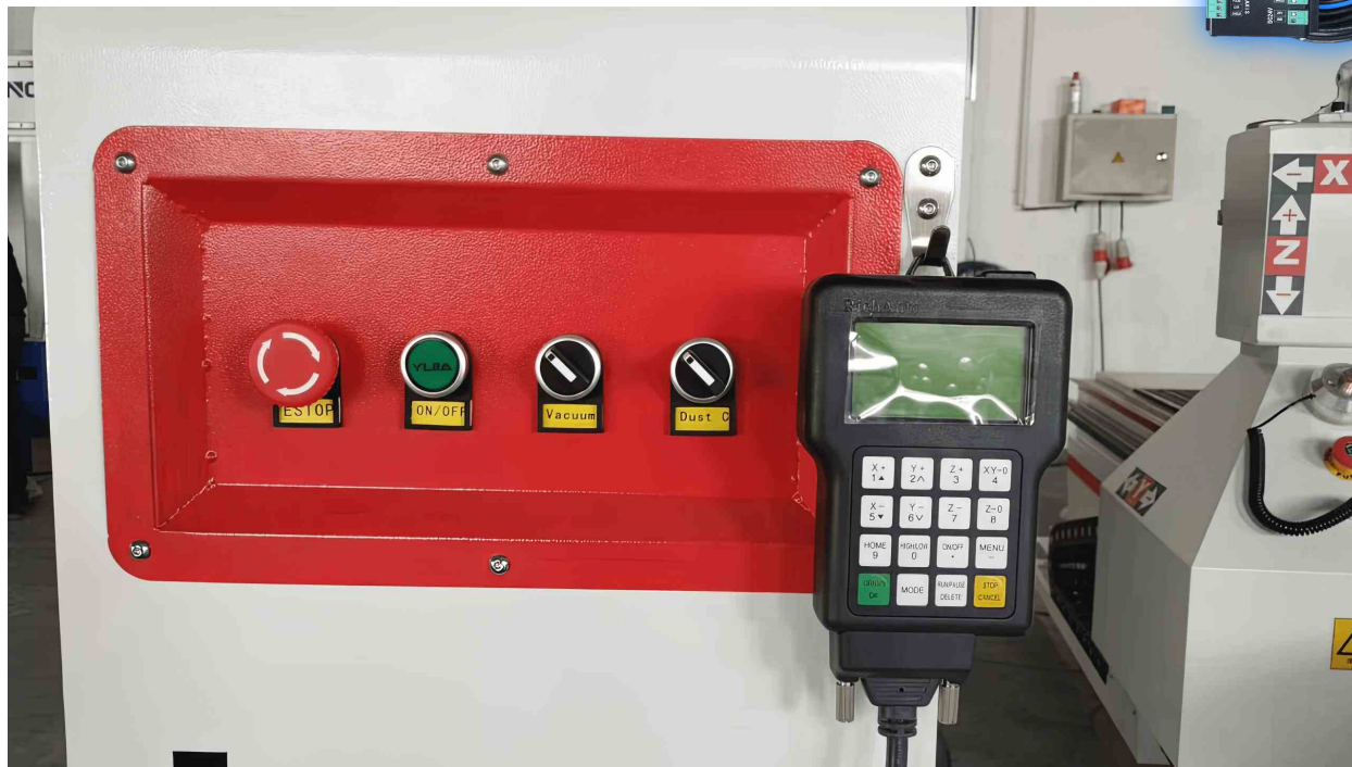
Control system for CNC Router